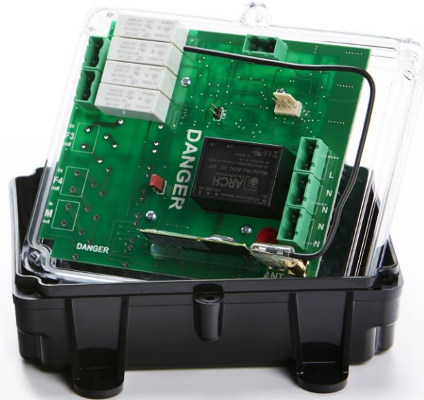
Transmitter model shown - 92204TX