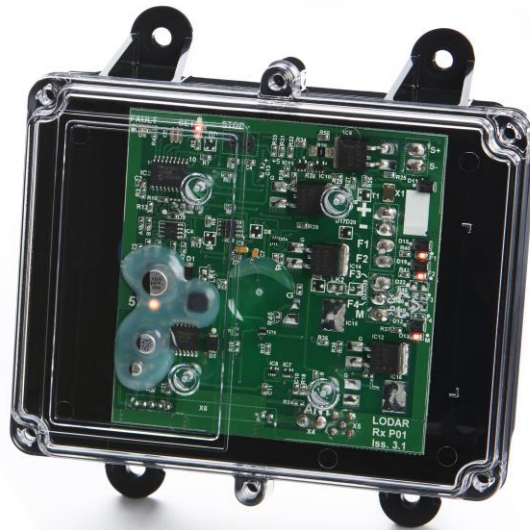
Transmitter model shown - 93204TX